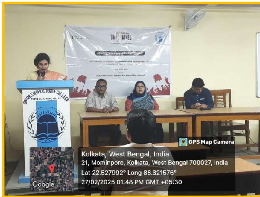
Picture with the core Committee members