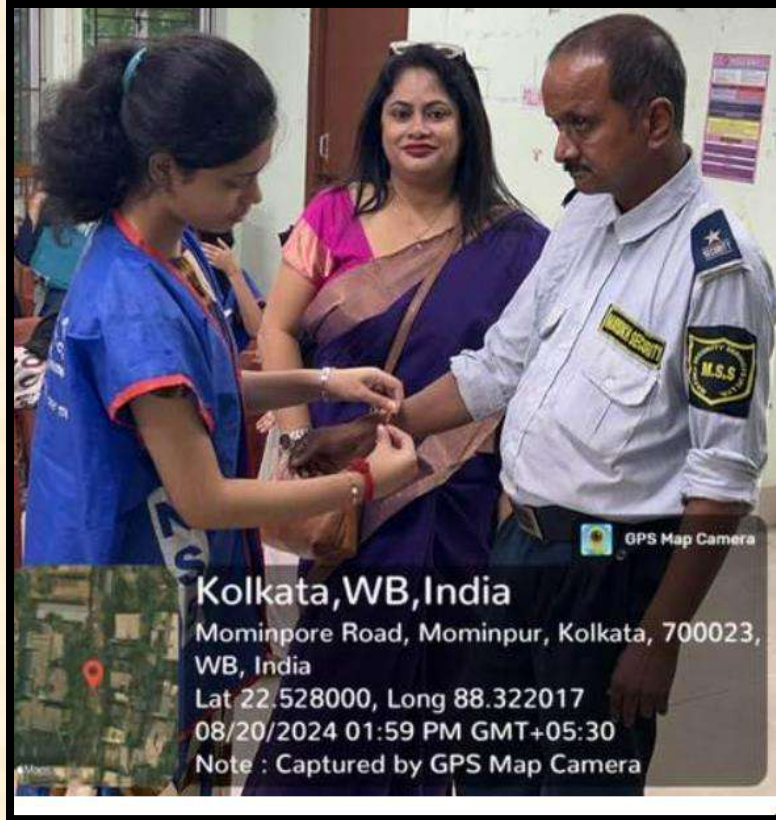
A volunteer is tying Rakhi to a security guard