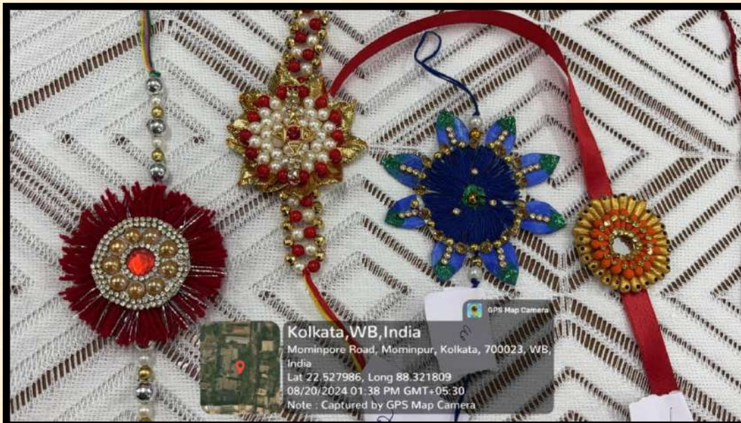
Hand-made Rakhis prepared by the volunteers