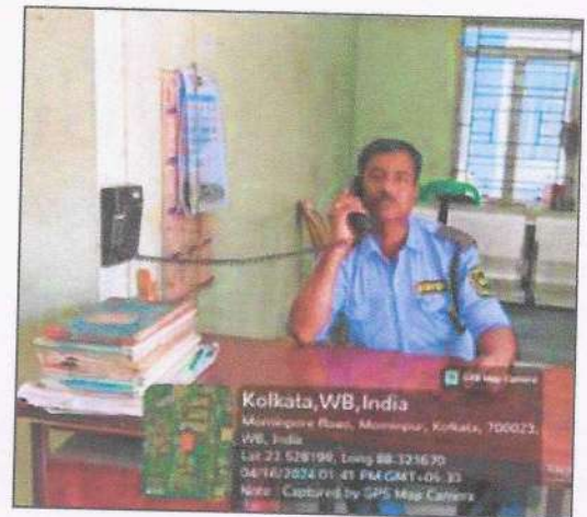
24 x 7 presence of Security Guards with intercom facilities