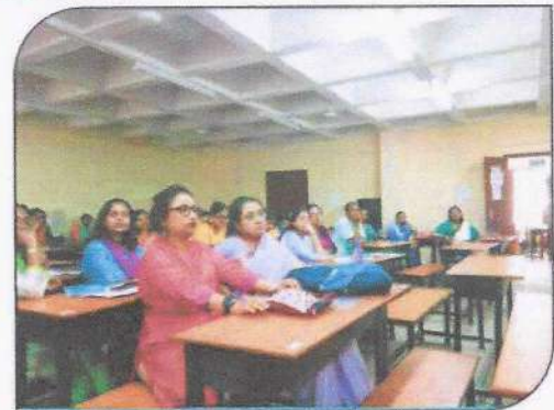
DISTINGUISHED FACULTY MEMBERS FROM DIFFERENT COLLEGES IN THE ICC WORKSHOP