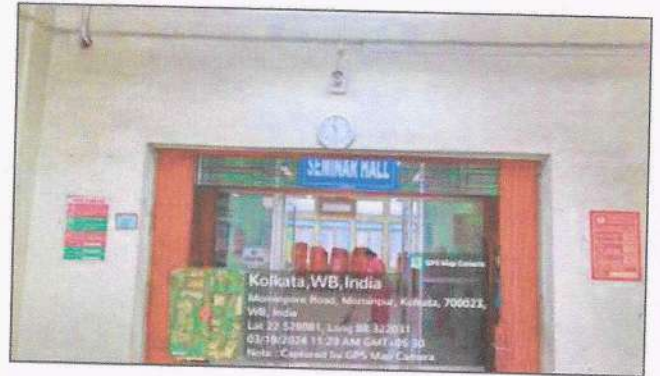
CCTV Cameras & Monitor