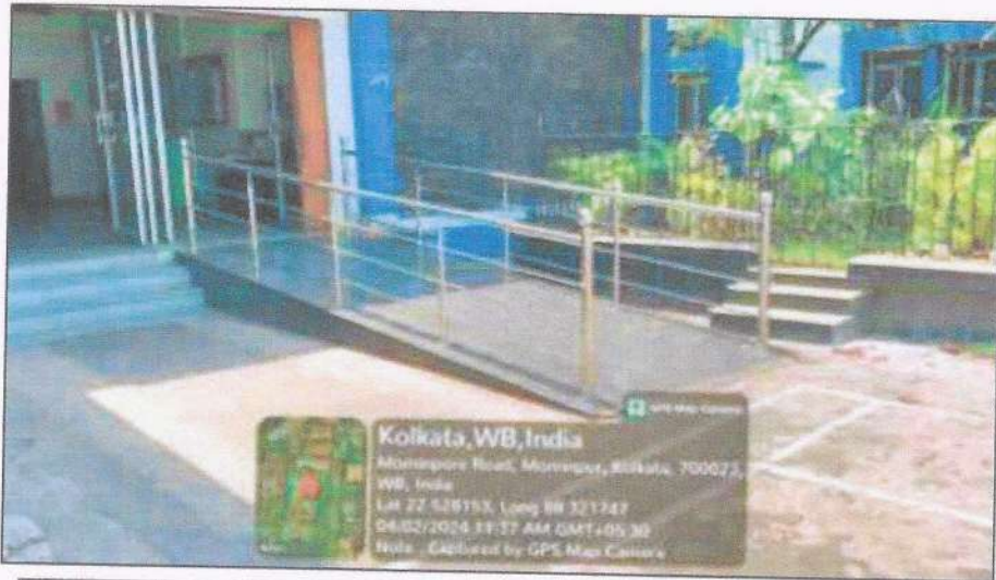
Ramp at the entry gate