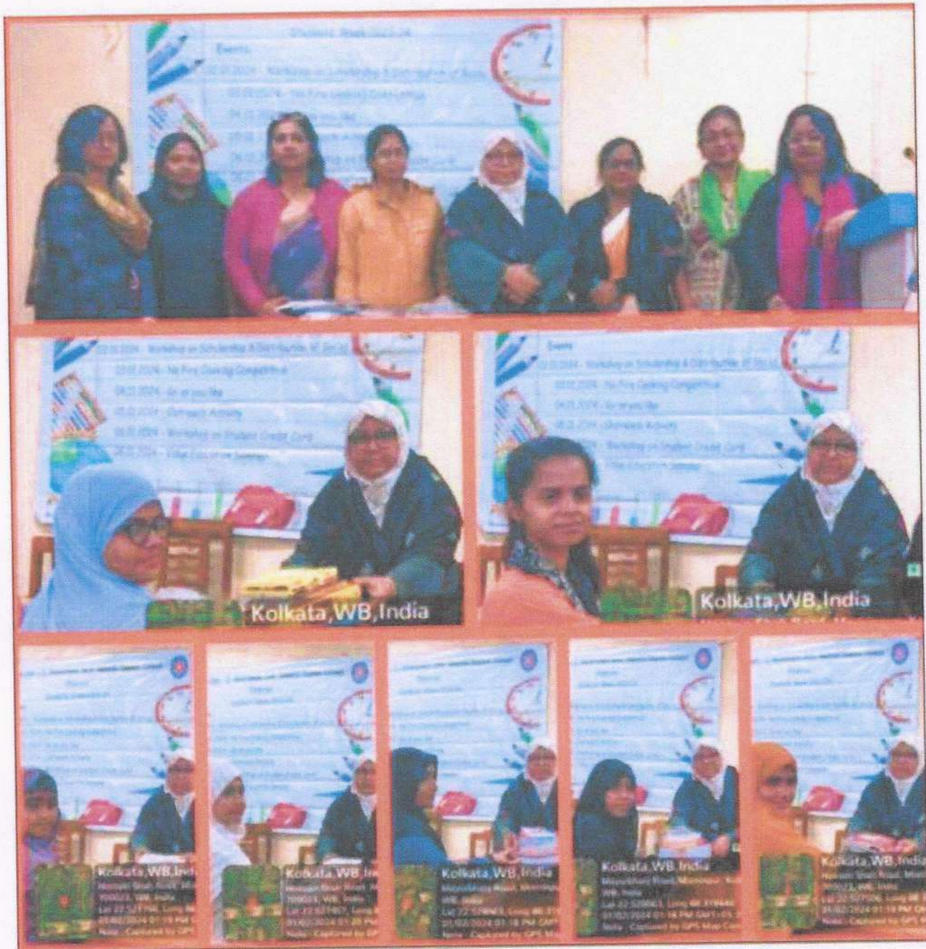
Distribution of Books among the selected students