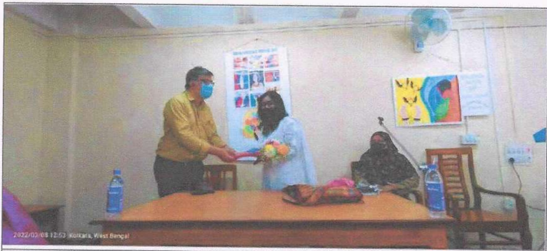
Felicitation of the invited guest by the IQAC Coordinator