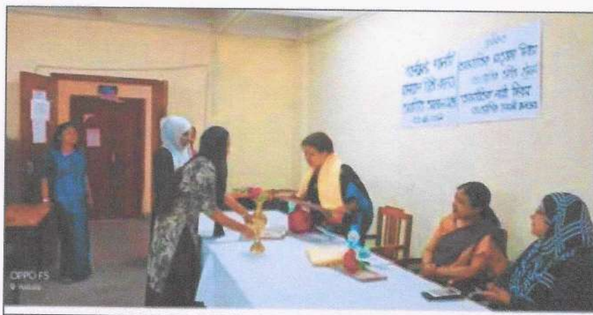
Felicitation by the College students to the invited speakers on International Women's Day.