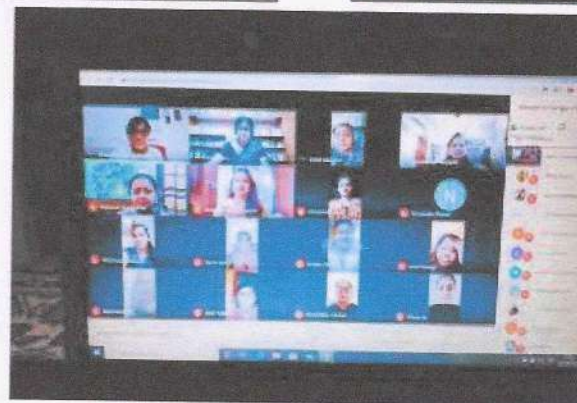
Webinar Photos on Dengue awareness camp