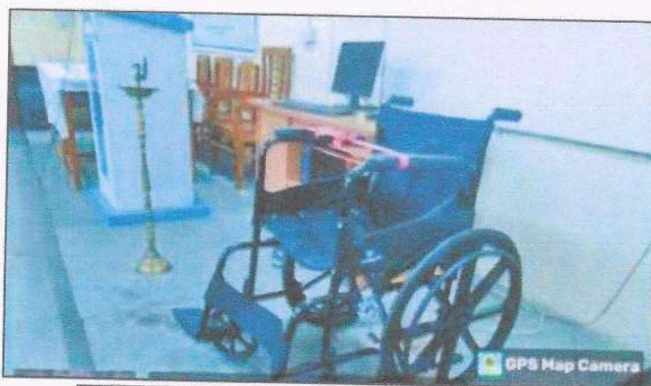
Wheel Chair funded by NSS Unit I