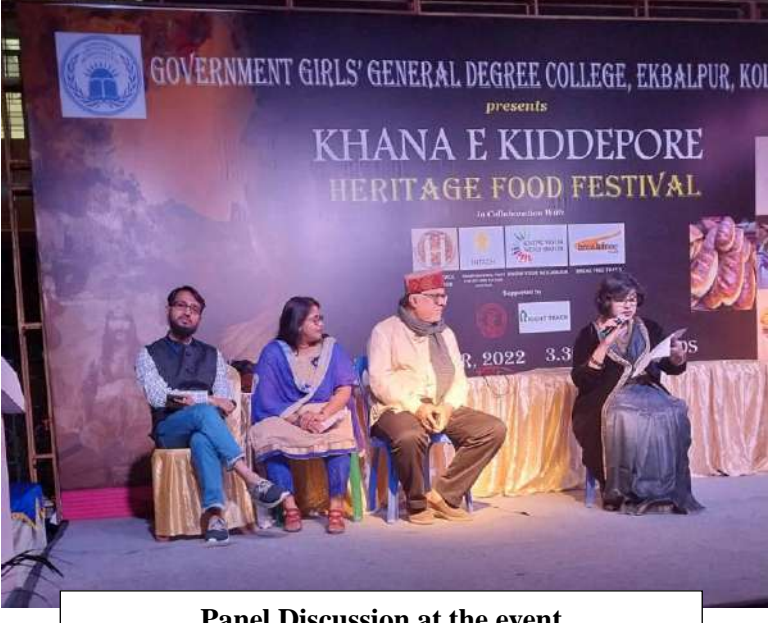
Panel Discussion at the event