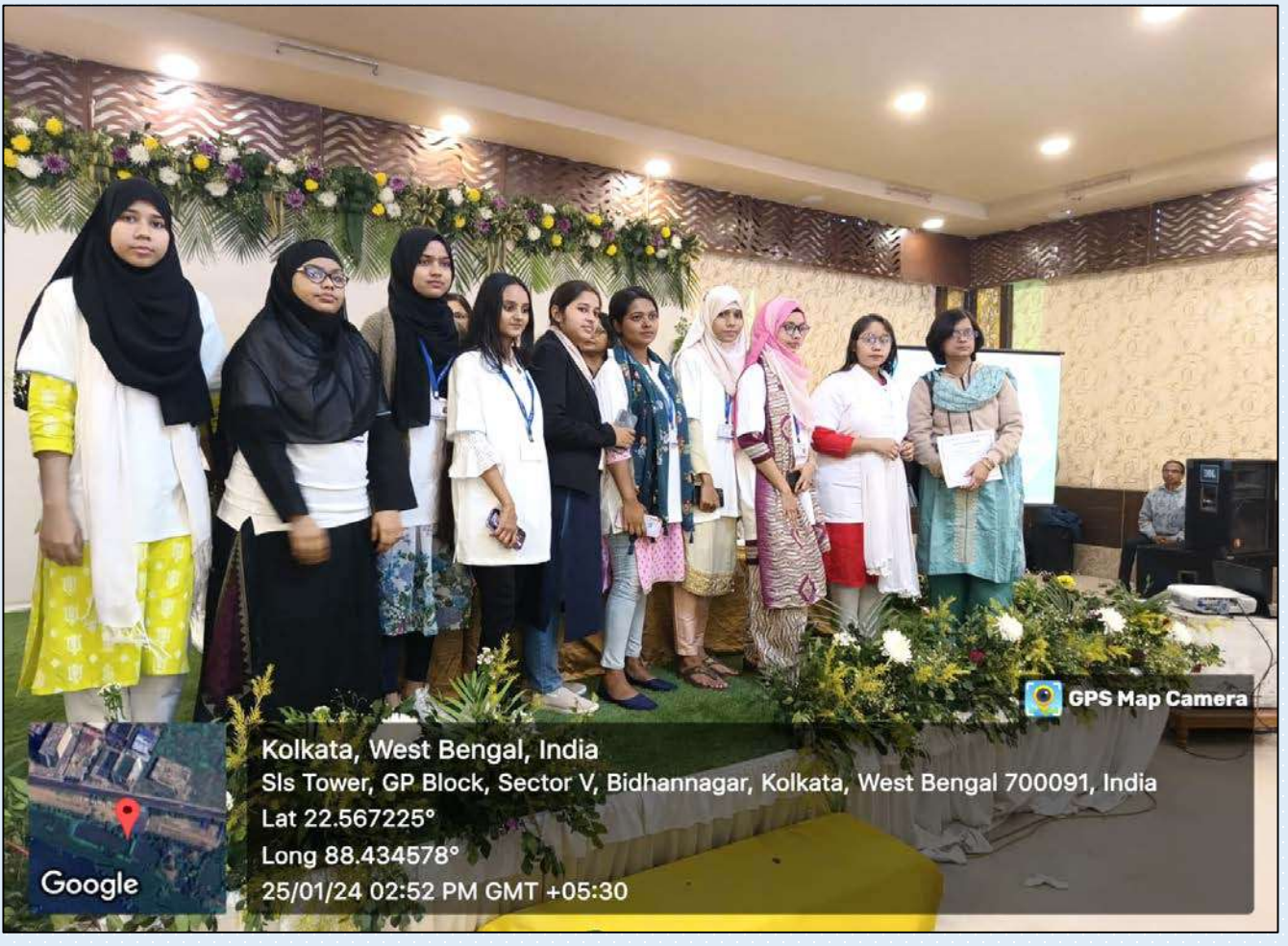
Explanation was given by the Students before one of the Evaluators