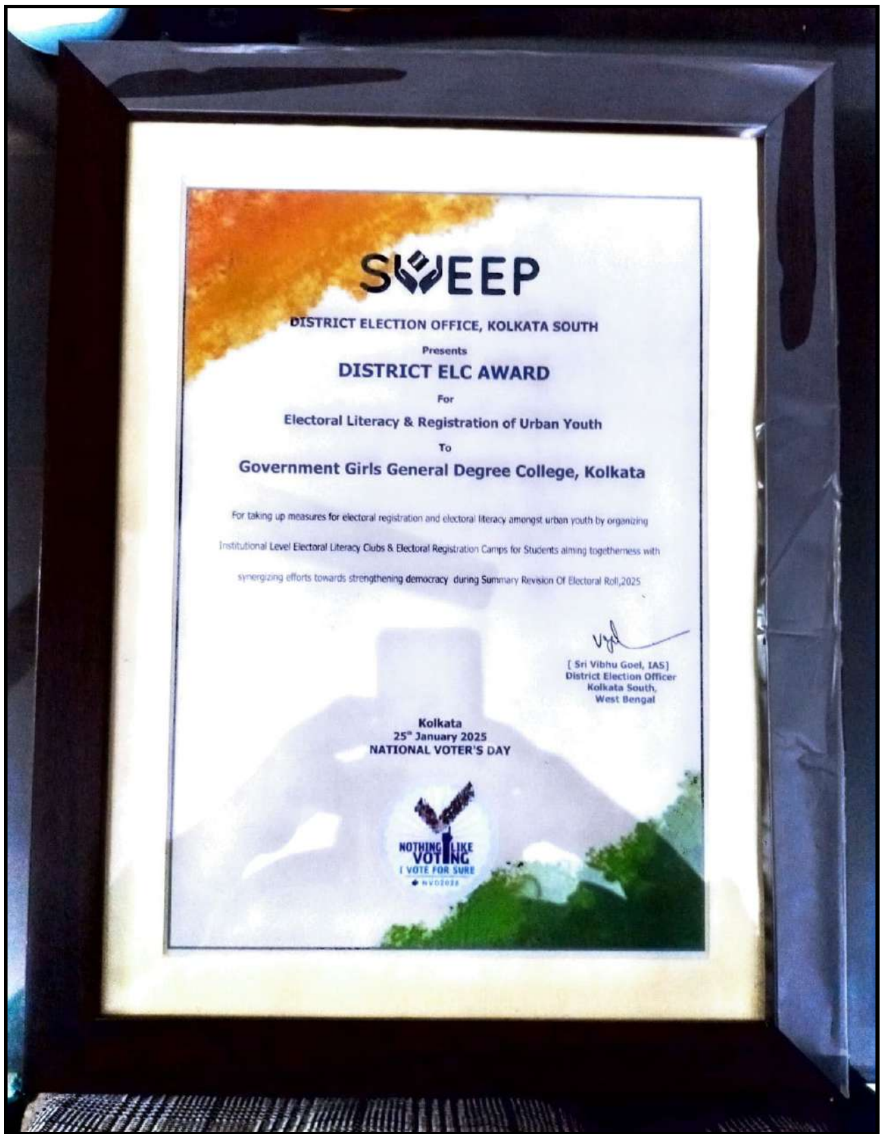
Figure 7: The citation