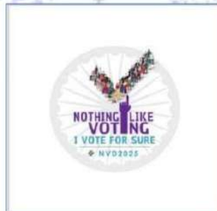
Figure 2: Invitation Card