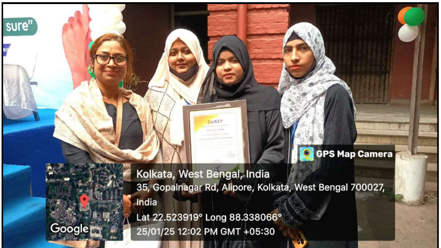
Figure 6: With the citation received by Nodal Officer and students of GGGDC