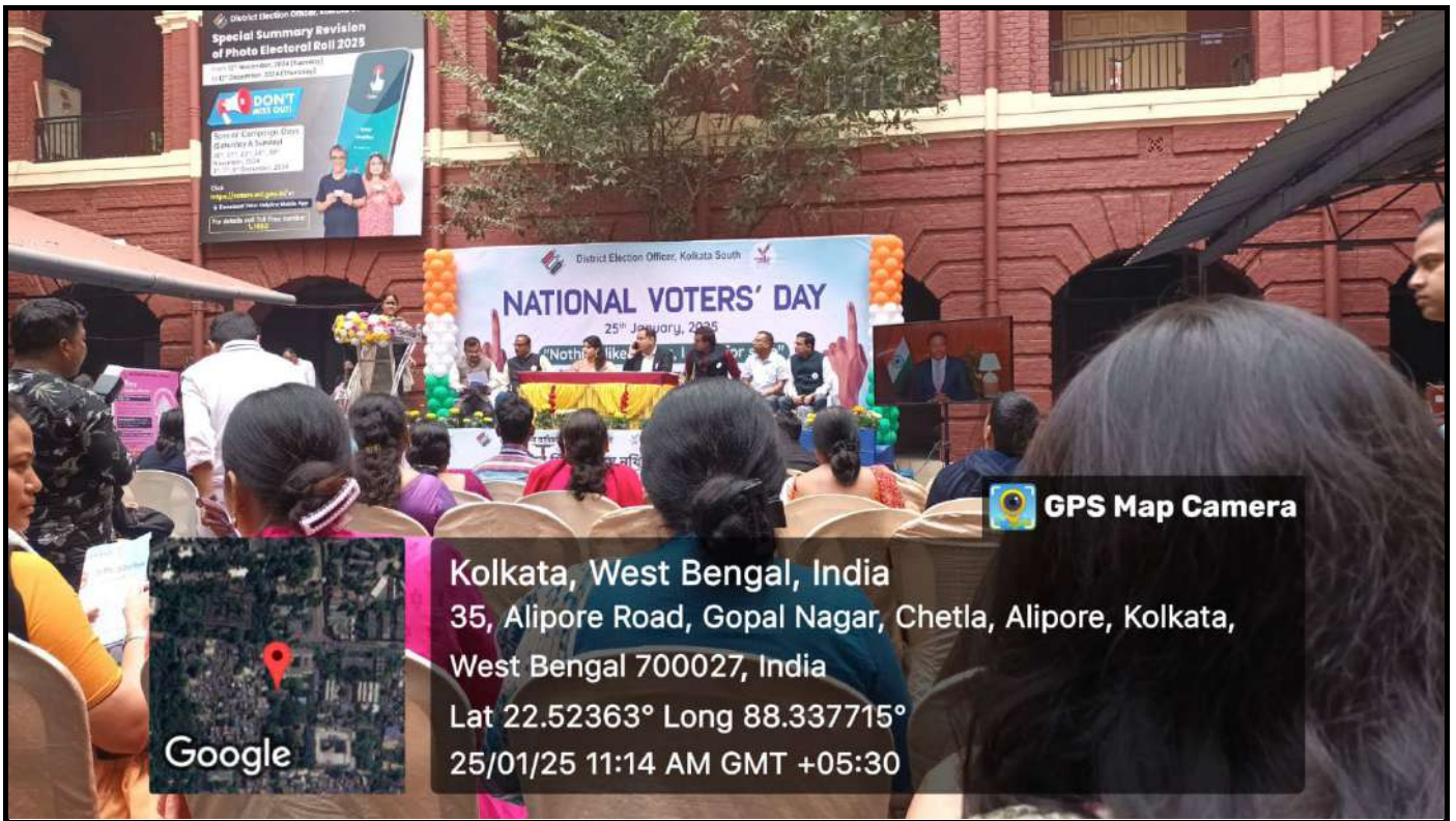
Figure 3: Celebration of 15 th NATIONAL VOTERS' DAY at Survey Building, 35, Gopal Nagar Road, Alipore, Kolkata, 700027