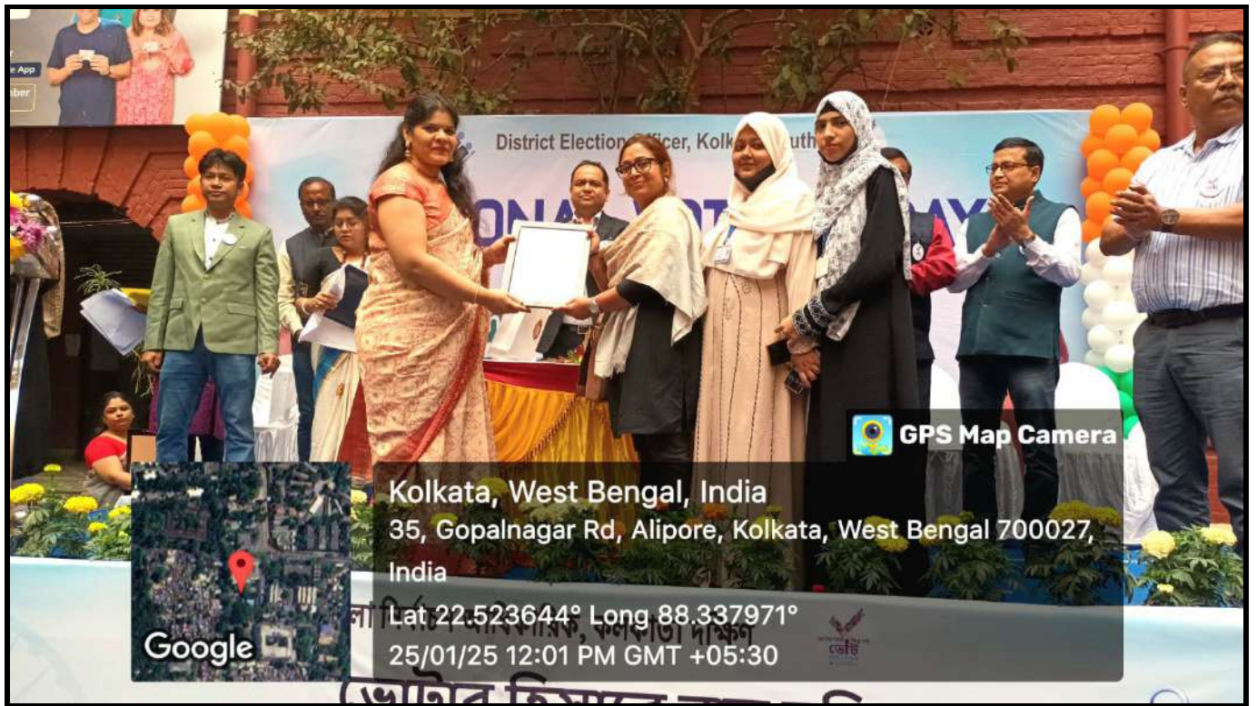
Figure 5: The citation received by Nodal Officer and students of GGGDC