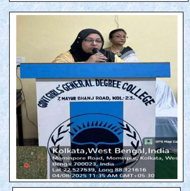
Presentation of Annual report by the honourable Principal