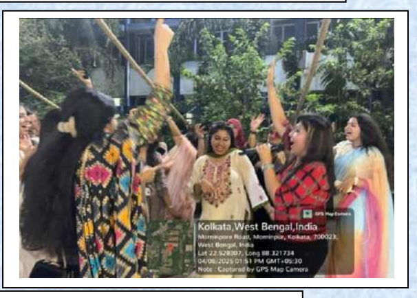
Students are enjoying the programme presented by the band group