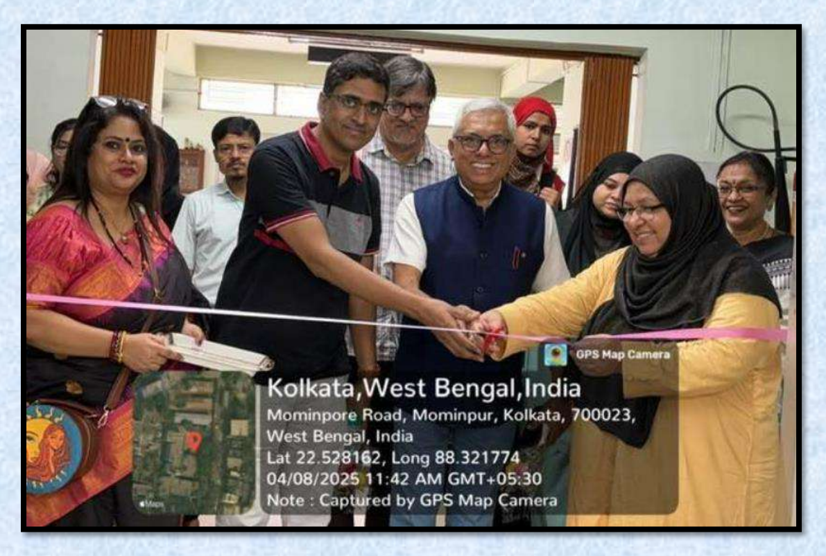
Inauguration of Food Stall

At 1:30 pm food stalls were inaugurated by the honourable guests where students presented various food stuff prepared by them. This event was organised to encourage entrepreneurship among the students.