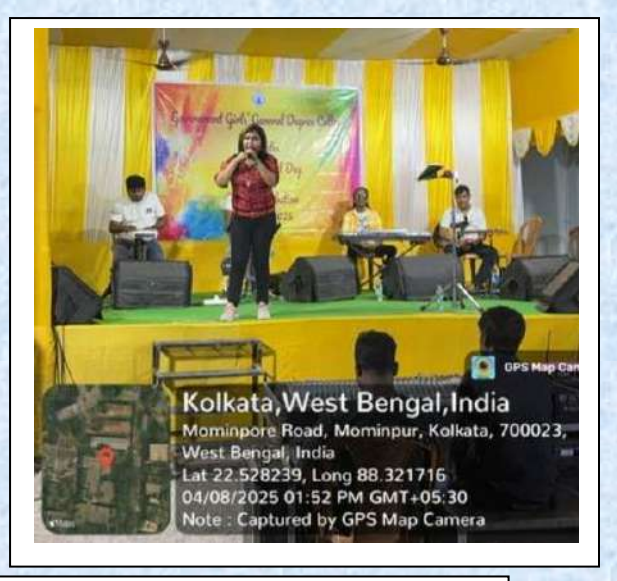
Performances by the singers from the invited band group