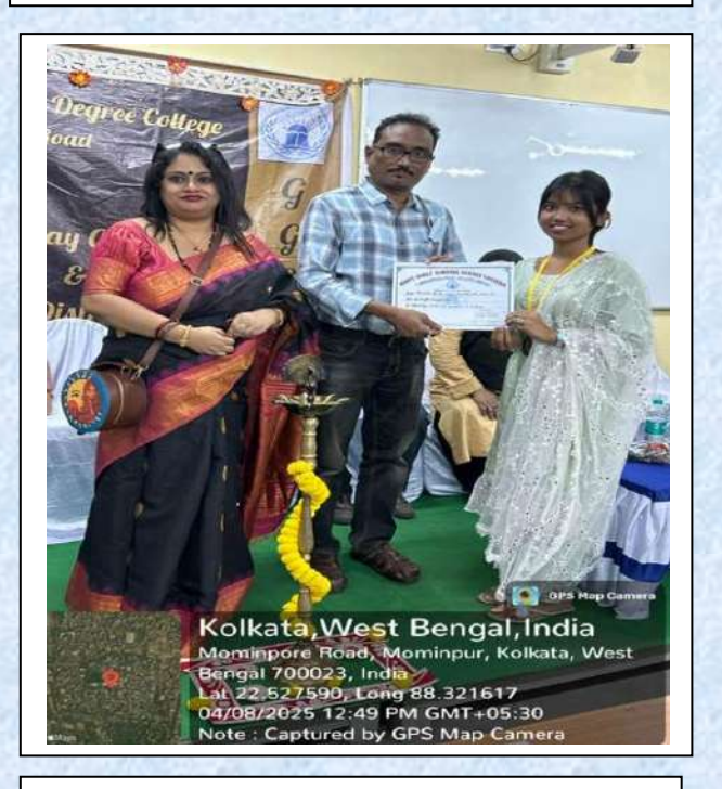
Prize under NSS category