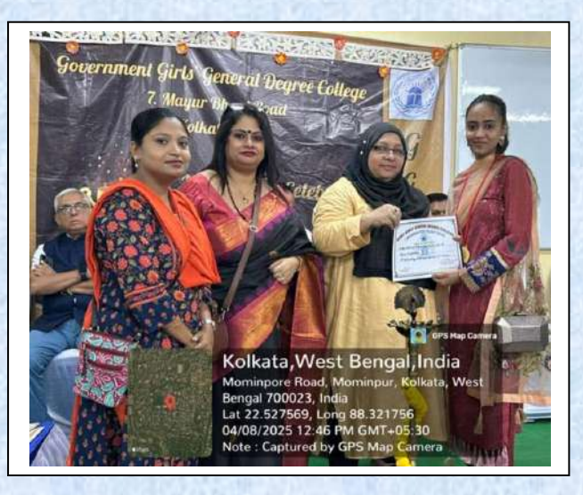
Winner of 'Dance competition' is receiving prize under cultural category