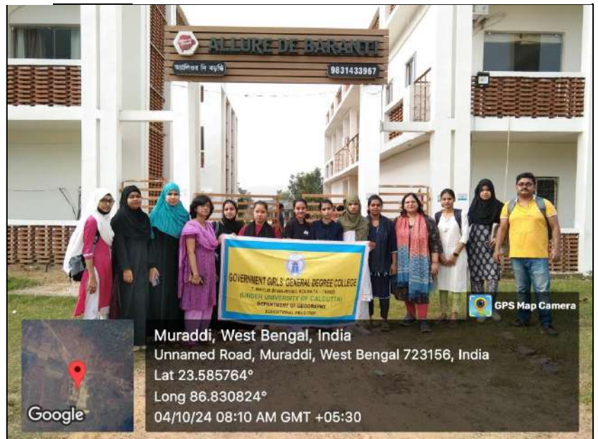
The group in front of the Place of Stay in Barhanti