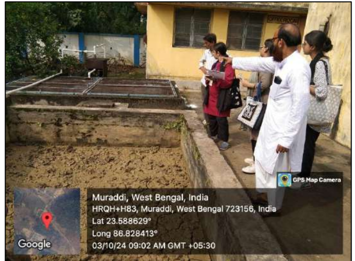
Inspection of the Water Treatment Plant