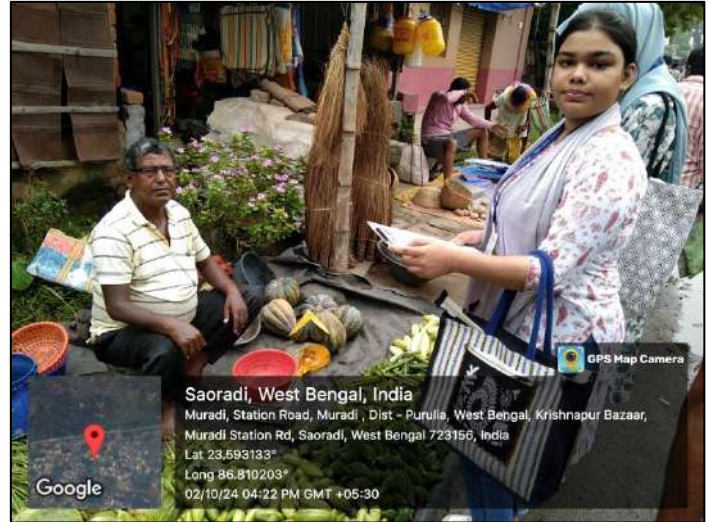
Local Haat Survey