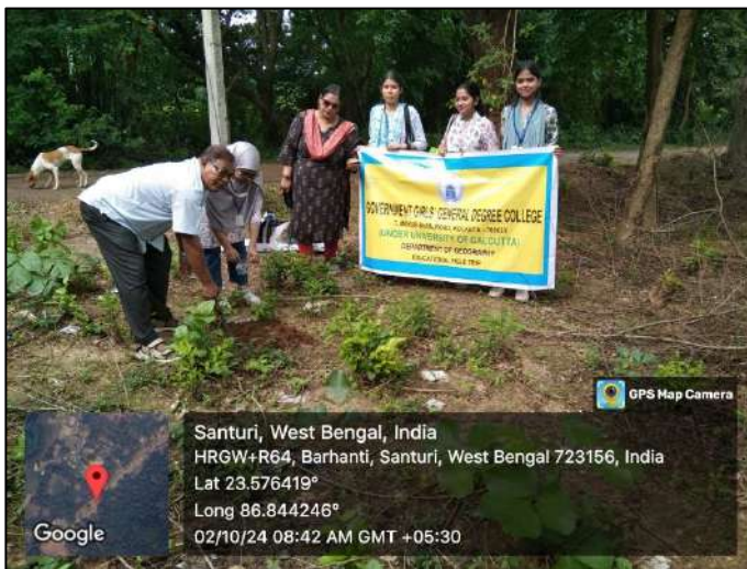
Soil Sample Collection from Vegetable Plots