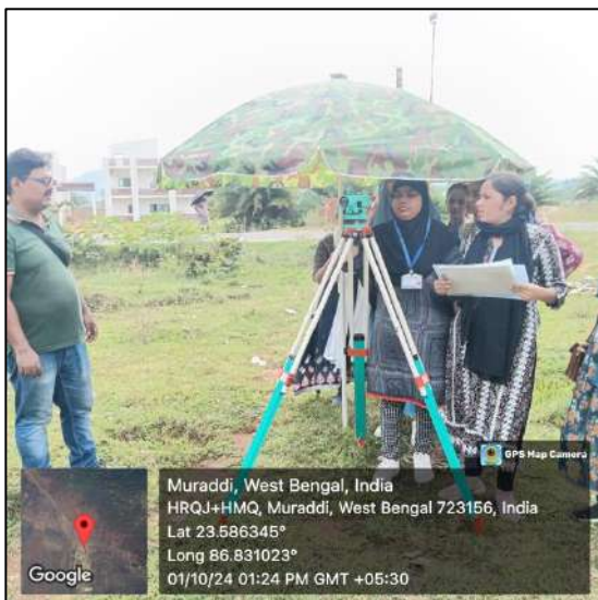
Performing Instrument Survey